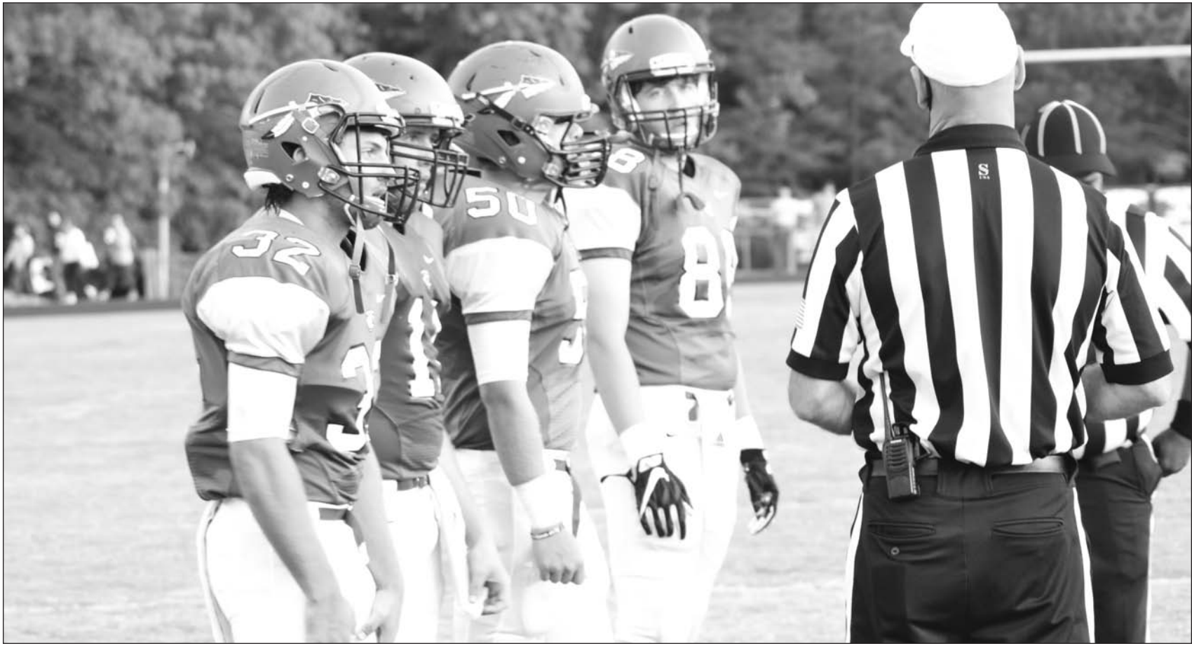
The Towns County football captains meet at midfield prior to the Prince Avenue Christian game for the coin toss..