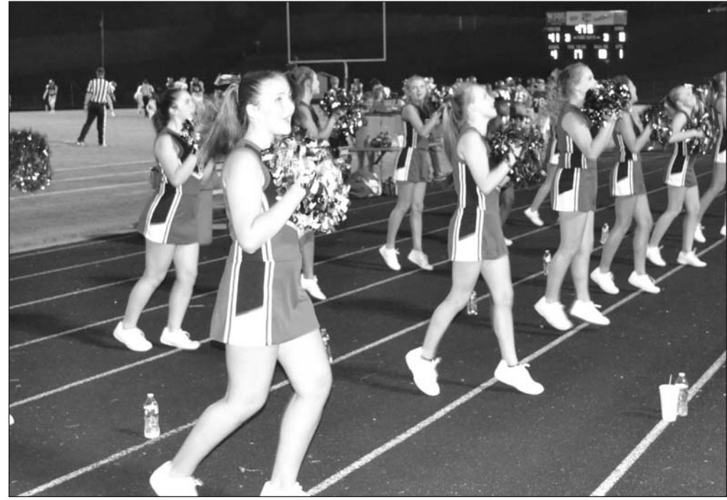
The Towns County cheerleaders are keeping the fans fired up.